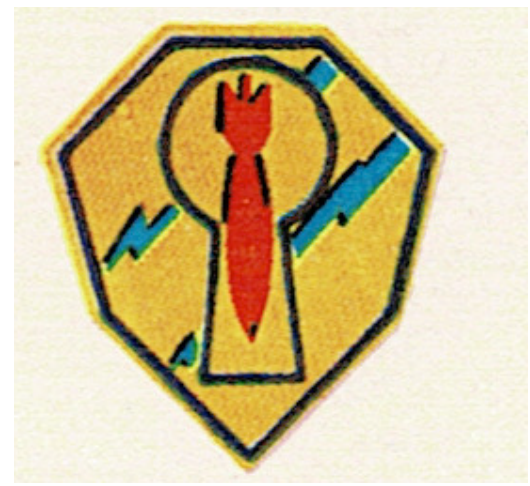
7 Observation Squadron emblem